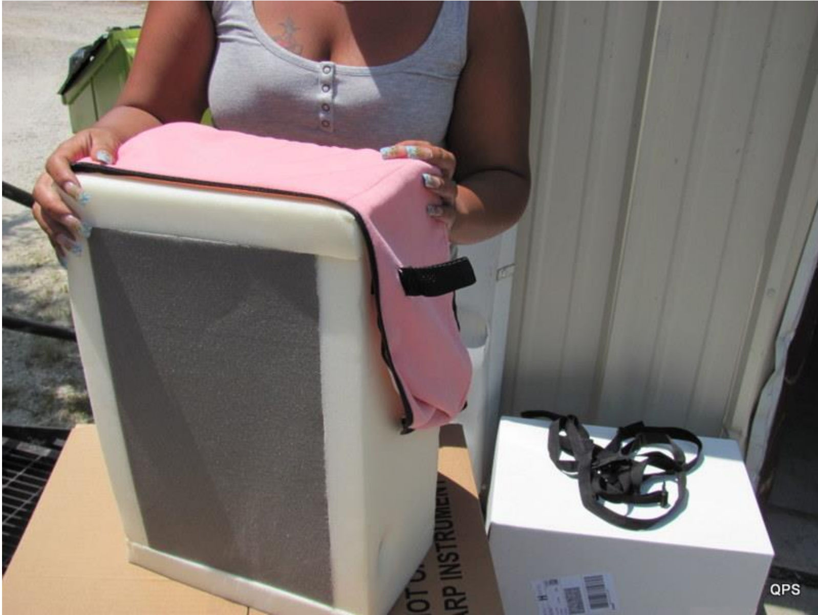
Image shows the rear strap threaded through body and cover.