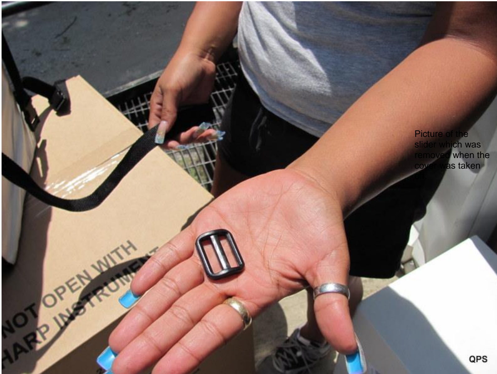
Picture of the slider which was removed when the cover was taken